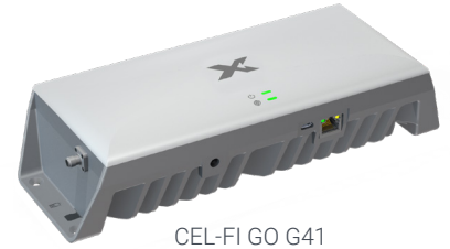
CEL-FI GO G41

Designed to solve cellular coverage challenges for indoor environments, the CEL-FI GO G41 is the most powerful carrier-grade solution in its class. Providing up to 100 dB gain, GO G41 is powered by the latest 4th generation Nextivity proprietary IntelliBoost chip to deliver reliable 2G, 3G, 4G, and 5G voice and data performance. GO G41 also supports 5GNR operation for seamless network migration and consistent connectivity. Plus, GO G41 is network safe and can be installed within minutes.